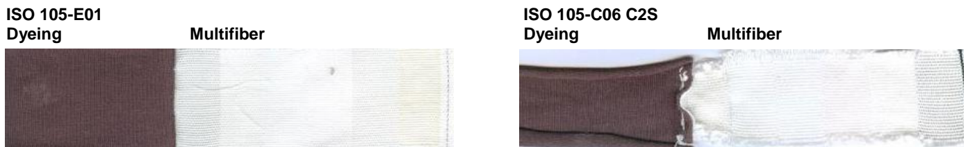
Figure 3: Fastness test to water severe (ISO 105-E01) and fastness to washing by 60°C (ISO 105-C06 C2S)

When dyeing a medium Brown shade with in total 2.5% Remazol® Ultra RGB dyes, using Sera® ECO WASH process, and checking fastness to water severe (ISO 105-E01) and Fastness to washing 60°C (ISO 105-C06-C2S) you'll reach a perfect result (Figure 3):